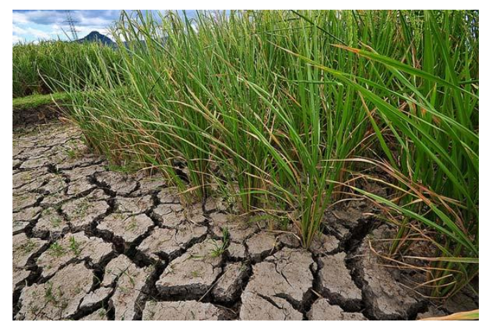
Figure 4. Drought-tolerant Rice Varieties Developed by IRRI.

This group focused on preparing communities and the agricultural sector for climate impacts through both adaptation and mitigation strategies. While mitigation strategies aim to reduce the severity of climate change by lowering emissions and enhancing resilience, adaptation measures are critical for addressing unavoidable damages and ensuring the sustainability of agricultural systems and communities. Key challenges include inadequate weather forecasting, limited extension services, insufficient cold storage, and poor access to drought-resistant crops. Communication barriers and over-reliance on vulnerable staples like rice further increase risks.